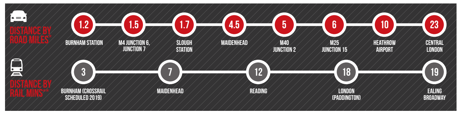
SOURCE: * FROM 349 EDINBURGH AVENUE SL1 4TU. SOURCE: THE AA ** TIMES FROM SLOUGH STATION. SOURCE: NATIONAL RAIL ENQUIRIES